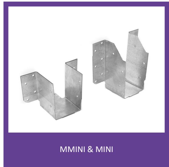
MMINI & MINI